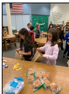
Erving Elementary students fill lunch bags for area homeless shelters