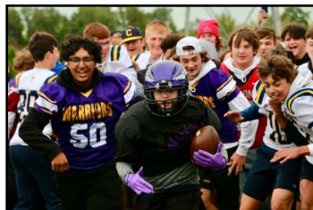
WBSD site host for 2022 Victory Day