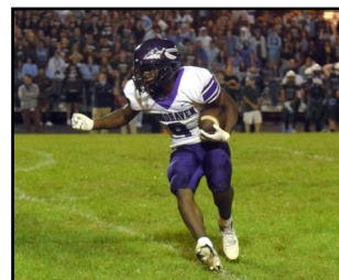
Under the lights on a Friday night